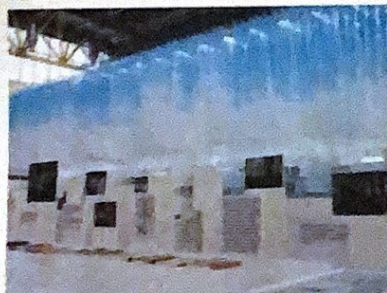
The Netherlands, the Country of Honour