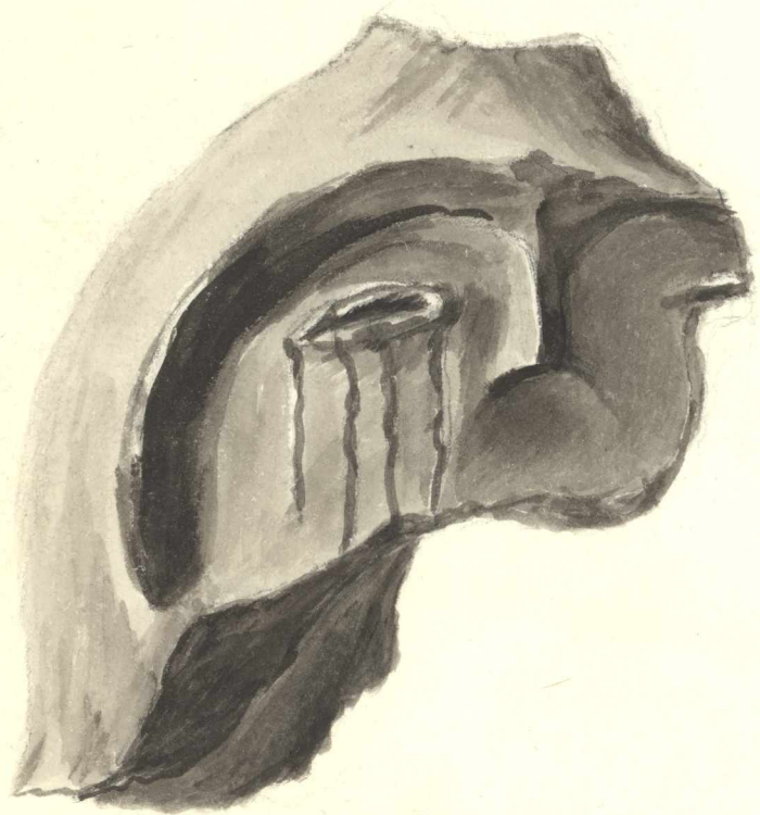
a - frente