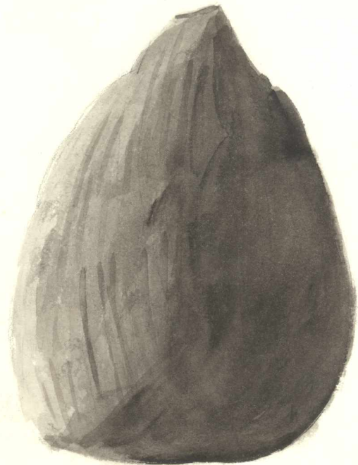
b - reverso